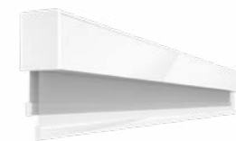
Aero Dual | Chainfree

Aero is award-winning and child safe, boasting a contemporary design, Auto-rise technology that can be activated from both the chain or the weight bar, and easy one-touch limit setting.