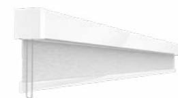
Aero Single | Chain