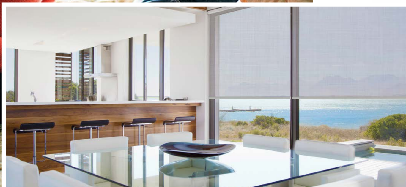
Easy Spring Ultra

Easy Spring Ultra is a completely chain-free, cord-free, child-safe solution. Unlike traditional spring boosted systems, the Easy Spring Ultra features our innovative Auto-rise technology and built-in decelerator, enabling a smooth, semi-automatic ascent at the touch of the weight bar.