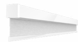
Aero Single | Chainfree