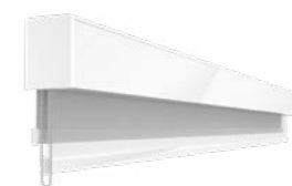
Aero Dual | Chain